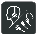
Four Wearing Options