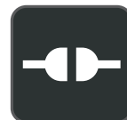
Plug and Play