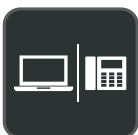
Multiple Devices Connection