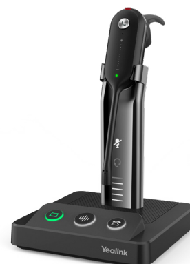
WH63 Teams WH63 UC