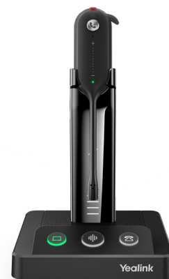
WH63 Teams WH63 UC

WH63 supports different ways of wearing, ear-hook, headband, and neckband, satisfying personalized needs. It can also free you up to 120m away from the desk, enjoying larger workspace and bettering work experience.