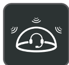
Acoustic Shield Technology

The Yealink WH63 is a new entry-level convertible DECT wireless headset. Work seamlessly with major UC platforms and integrate natively with Yealink IP Phones. For crystal sound experience, Yealink HD Audio Technology and Acoustic Shield Technology make you talk and hear clearly during phone calls and video conferencing. Easily finger-touch control, 19g lightweight design, interruption free, WH63 is a nice convertible headset for work.