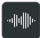
Optima Audio Experience